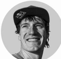
Sebastian Kienle Ironman World Champion